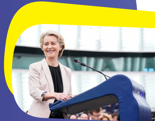
Ursula von der Leyen President of the European Commission

As of 2025, the new joint network of EU Local Councillors will be fully operational. Members will receive a series of revamped products featuring a new visual identity, including a new newsletter, while keeping their privileged access to key EU products and services, website, etc.